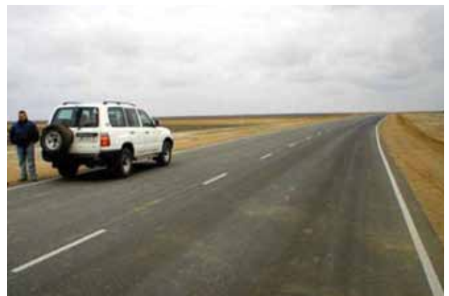
Completed road after 2 very cold winters

TERRAM Frost Barrier was installed on the main access road and railway to the oil production area for a new Kashagan Oil Field in Kazakhstan in the summer of 2003. It has now performed its function perfectly as anticipated for two summers and two winters thus demonstrating its unique ability to deal with these challenging problems in this harsh environment.